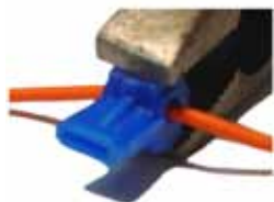
Crimp with pliers