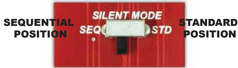
(Shown in sequential mode)

Please follow all local laws concerning exterior lighting.