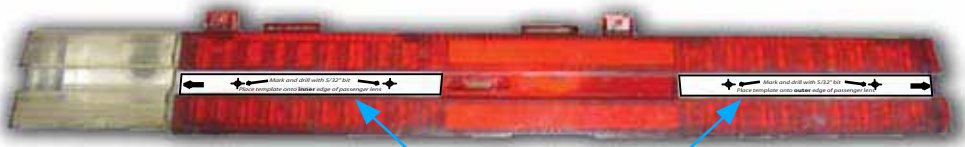
Templates placed on the passenger lens.

Each lens needs 4 holes drilled. Cut out the included templates and place them on the front side of their appropriate lenses. Mark the drill locations and drill with 5/32 drill bit. Be very careful not to press too hard while drilling. It takes very little effort to drill through the plastic. Let the drill bit do all of the work and use a low speed setting.