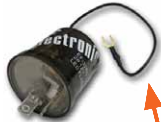
Black wire must be grounded

When using a stock bi-metal flasher, it is recommended that a standard duty flasher be used instead of a heavy duty flasher. If your turn signal circuit includes LED turn signals in the front as well as the rear, the turn signal circuit will not have enough resistance load to operate an original bi-metal flasher and this no-load flasher will be required for both the turn signal and emergency flashers.