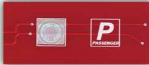
Passenger Side shown

Each LED panel is marked Driver and Passenger identifying where each respective LED panel is to be mounted. After all the angle brackets have been placed, test fit the LED panel to be certain it sits flush. Once satisfied, peel the remaining protective plastic from the angle brackets and carefully attach the LED panel making sure all the gaps between the LED panel and the housing are the same and that the LED panel is parallel to the housing lip. We have found the provided double sided tape works well and has a strong bond once it has been securely pressed to its mounting surface. For an extra sense of security, a few seams of silicone may also be added. Note, everything we use to mount the LED panels does not alter the original housing in any way.