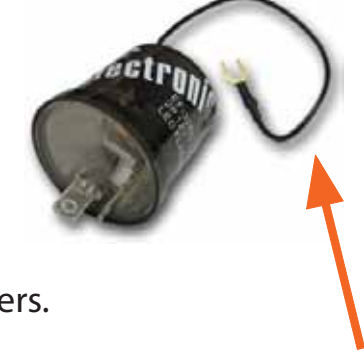
Black wire must be grounded

When using a stock bi-metal flasher, it is recommended that a standard duty flasher be used instead of a heavy duty flasher. If your turn signal circuit includes LED turn signals in the front as well as the rear, the turn signal circuit will not have enough resistance load to operate an original bi-metal flasher and this no-load flasher will be required for both the turn signal and emergency flashers.