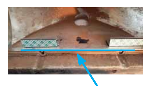
Measure 1/4" from edge.

1. Looking at the housing measure back from the lower lip 1/4" and mark. Then mount 2 angle brackets, leaving a gap in the cener.