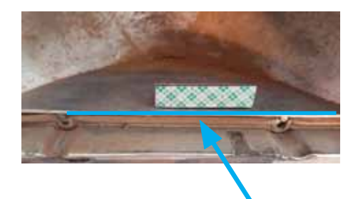
Measure 1/8" from edge.

2. Flip the housing around and measure back from thenlip 1/8" and mark. Then mount 1 angle brackets in the center.