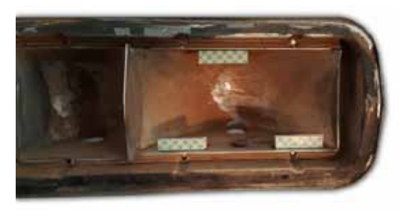
PASSENGER SIDE shown.

Looking at the PASSENGER SIDE housing, the bottom edge will need 2 angle brackets, while the upper edge will use 1.